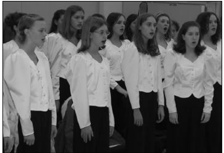
Cantabile members warm up before their December concert.

Fee: $200 per year, payable in installments