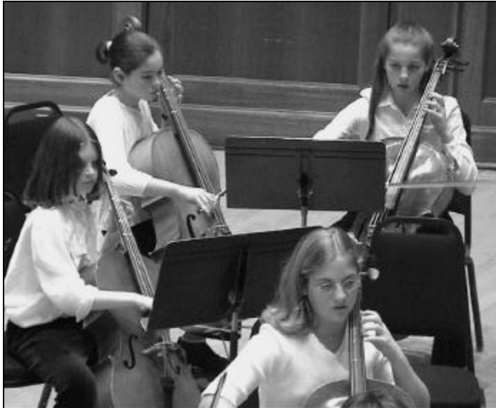
ASTRO members perform in the Lawrence Chapel during their November, 2001 concert.