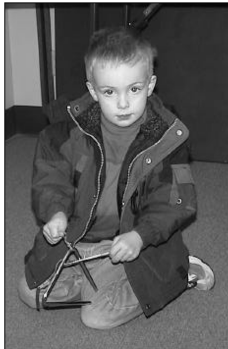
The instrument petting zoo was a favorite attraction at the Open House.

Please mark your calendar for the next parent meeting on Saturday, April 27, 10 a.m. - noon, in Room 156, Shattuck Hall. Refreshments will be served.